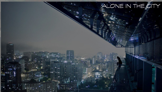
ALONE IN THE CITY