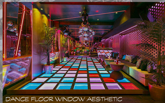
CITY WINDOWS TO MIMIC 70s DANCE FLOOR