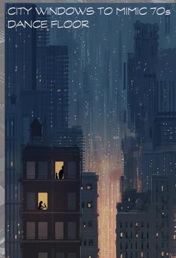
CITY WINDOWS TO MIMIC 70s DANCE FLOOR