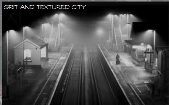
GRIT AND TEXTURED CITY