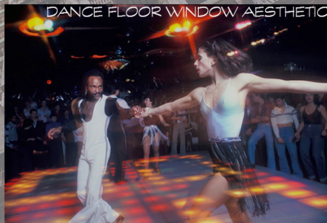
DANCE FLOOR WINDOW AESTHETIC