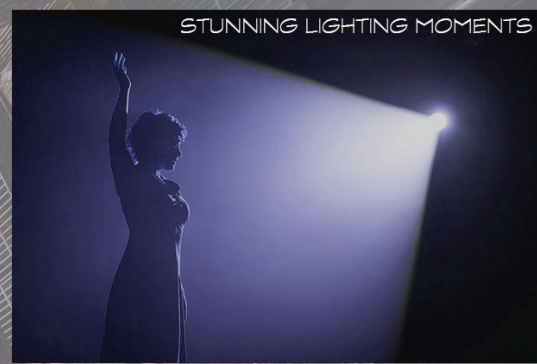
STUNNING LIGHTING MOMENTS